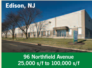
Edison, NJ 96 Northfield Avenue 25,000 s/f to 100,000 s/f