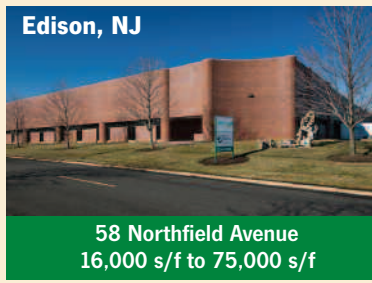
Edison, NJ 58 Northfield Avenue 16,000 s/f to 75,000 s/f