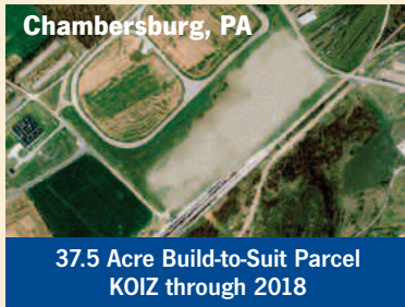
Chambersburg, PA 37.5 Acre Build-to-Suit Parcel KOIZ through 2018