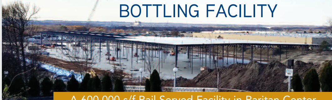
A 600,000 s/f Rail Served Facility in Raritan Center

The Raritan Central Railway will soon be welcoming another major customer to its operations at the Raritan Center Business Park. AriZona Beverages USA has begun construction of a new $40+ million dollar, 600,000 square-foot bottling facility adjacent to its current 470,000-square-foot facility at 30 Clearview Road in Woodbridge, New Jersey. The modern, rail-served plant will support AriZona's expanding operations in the region and will boost its Raritan Center footprint to over one million square feet.